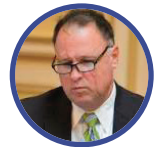
Creigh Deeds Candidate for State Senate District 25